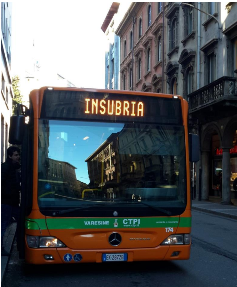
Bus Insubria service - Varese

This card gives you unlimited travel on all means of transport in the Lombardy region. You can buy it at any railway station (109€ as of 2023).