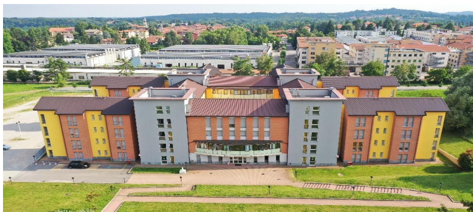
Collegio Cattaneo - Varese