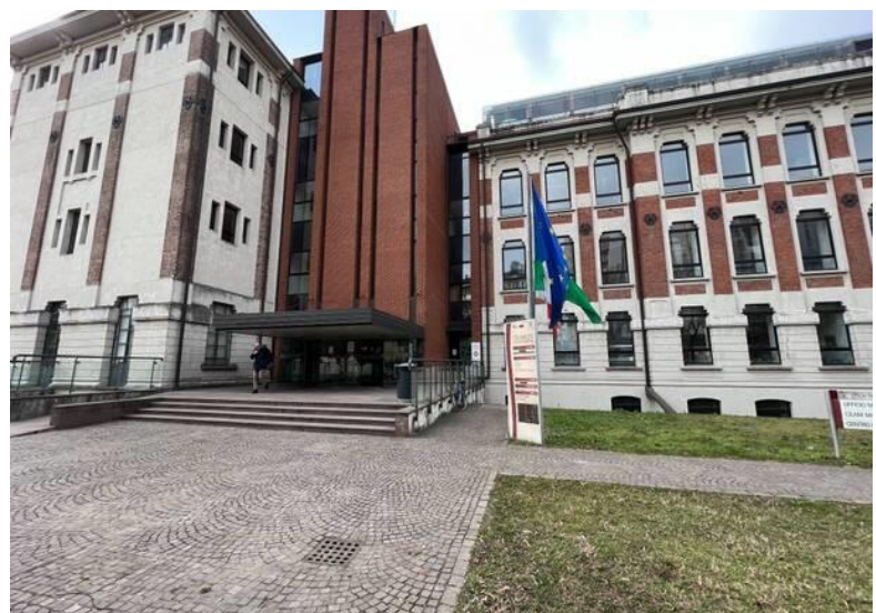
Polo didattico Molino Marzoli