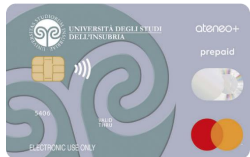
Ateneo Più Card

Once enrolled, you will receive the university badge “Carta Ateneo Più”, a magnetic card with your photo that allows you to use the university services. You must show it to access exams, study rooms, and libraries.