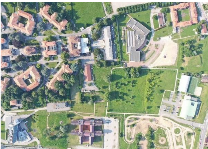
Aerial view of Varese Campus

The Bizzozzero and Monte Generoso campuses are the places you will go to every day to attend classes in the different buildings.