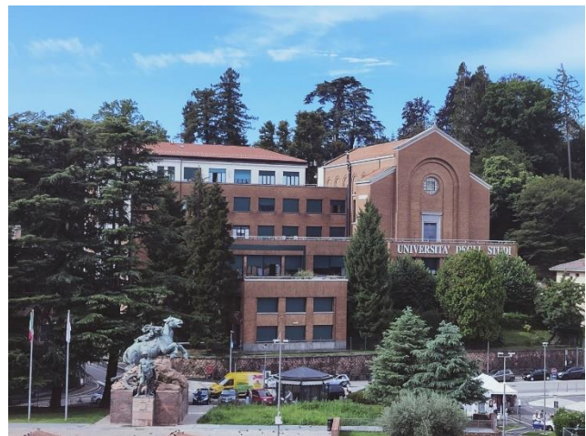
The Central Administration building

You will never have to visit the administration building unless you need to pick up your university card (Carta Ateneo Più) after completing the enrollment.